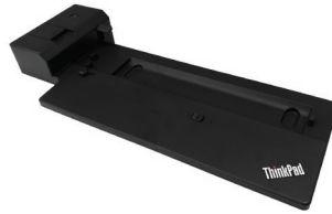
ThinkPad® Pro Docking Station