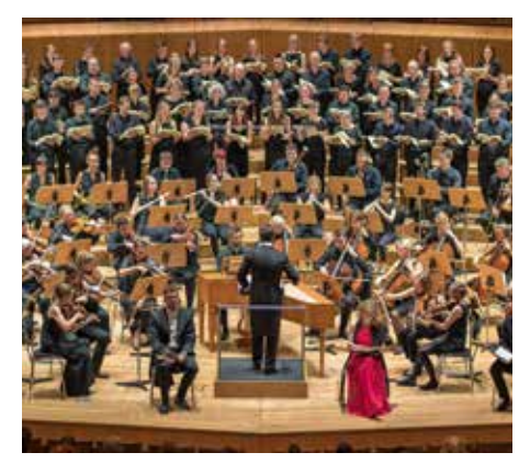
The Bamberg Symphony: an extraordinary orchestra in an extraordinary city

Bamberg's beer is not the only thing in high demand worldwide. The Bamberg Symphony Orchestra also enjoys an excellent international reputation and spends even more time abroad than the university president. Another major export is the professional basketball talent of the Brose Baskets. Over the years, the nine-time German league champions have turned heads throughout Europe. The enthusiastic cheers and exceptional volume of the fans at home games has earned Bamberg the affectionate nickname Freak City , whereas visiting teams find themselves having to endure what is for them Franconian hell .