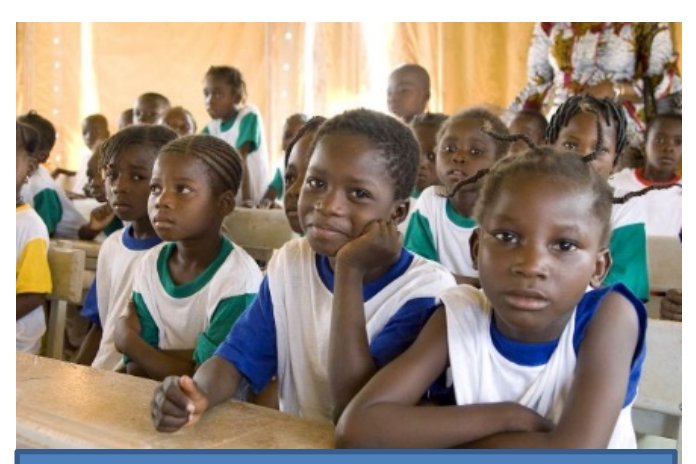
All over the world migrant students lack of education.

African governments should design education policies that cater for the needs of children and youth displaced by conflicts and natural calamities in order to foster growth, peace and stability in the continent, experts said during the report launch in Nairobi. Experts stressed the need for African countries to integrate refugees' education in their national development plans. They mentioned that, "The governments in the Horn of African region that has a huge refugee crisis should enact policies that facilitate access to basic services like education to the youth and children living in camps."