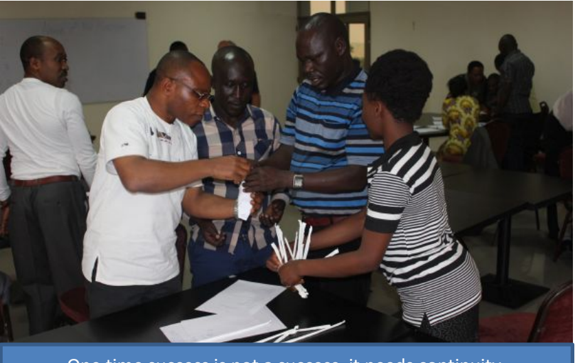
One time success is not a success, it needs continuity.

Collegial learning communities have proven to be an excellent model for developing school-specific development steps, jointly developing the necessary competencies and jointly ensuring implementation within the college. An essential condition for success for these professional learning communities is the consistent reference of all team activities to the improvement of the students' learning success.