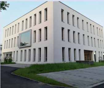
Institute of Oriental Studies Schillerplatz 17, Bamberg