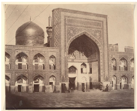
Main Gate of the Imam Reza Shrine in Mashhad (1850s)

Due to the effects of colonial aspirations and technical progress in transportation travelling beyond one's own country became an option for a wider public in the Islamic World. Since the second half of the 19th century, more Muslim believers than in the preceding centuries had the opportunity to fulfill their religious duty and embarked on the pilgrimage to Mecca and Medina and other destinations such as the Shiite shrines in Iraq. Pilgrims from Persia also set out in large numbers for various holy sites.